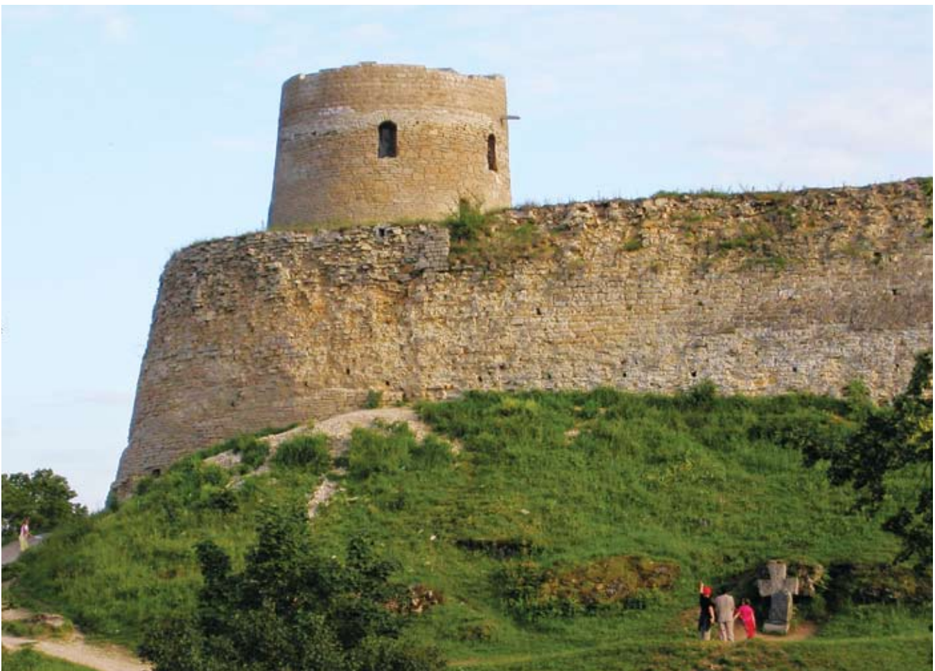
Izborsk Fortress, Russia.