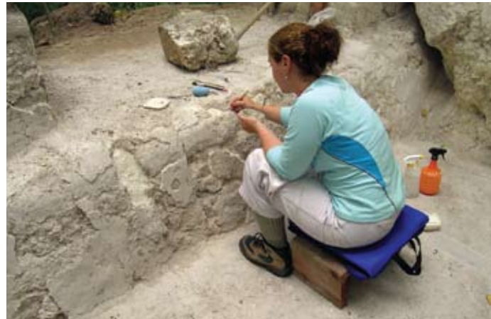
Conservation in process at Mirador, Guatemala.