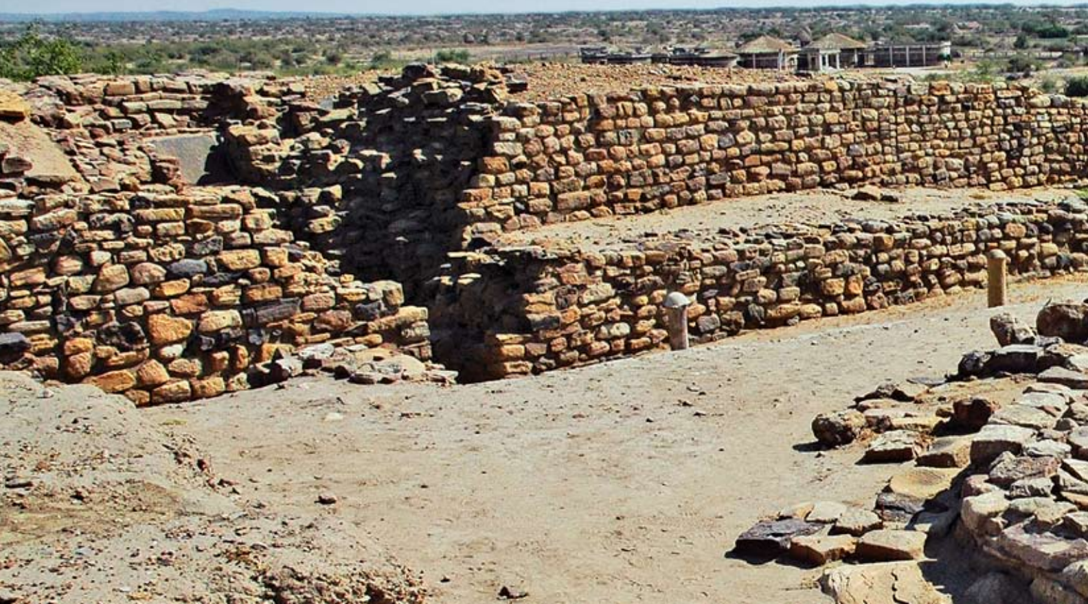
The Harappan site of Dholavira, India.