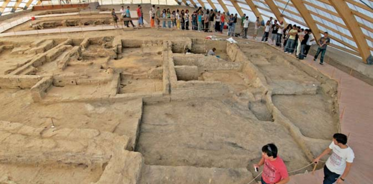
Visitors to the newly sheltered excavations at Çatalhöyük, Turkey.

Çatalhöyük is a 9,500-year-old town, one of the earliest in the world, with rich art and sculpture in its houses.