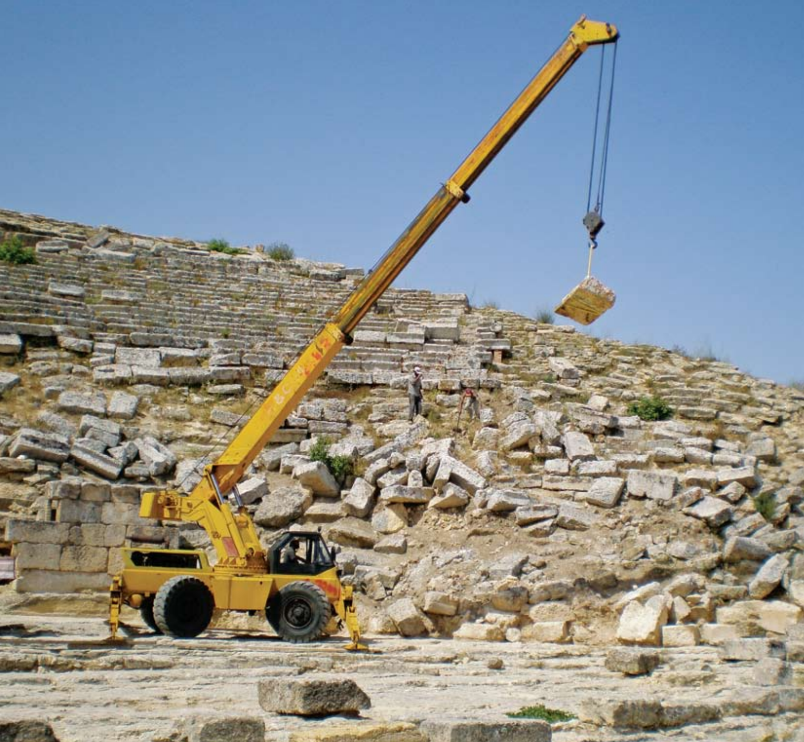
Using a mobile crane to stabilize and preserve the amphitheatre, Cyrene, Libya.

Cyrene's temples, tombs, agora, gymnasium and theatre were originally modeled after those at Delphi.