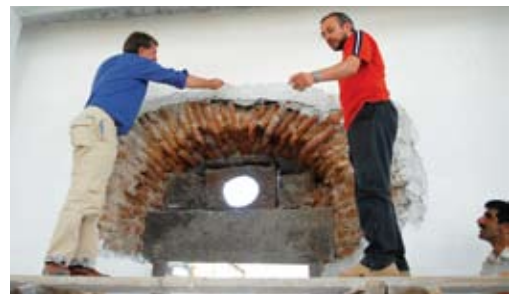
Plastering the Namik Kemal Community Center interior, Kars, Turkey.