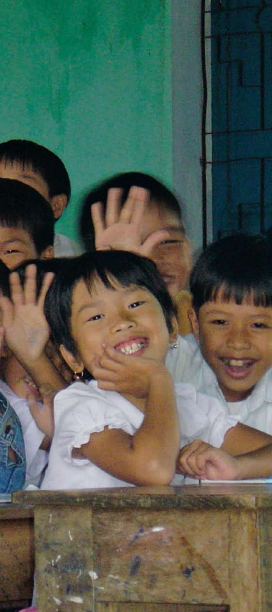
School children from the Vietnam World Heritage in Young Hands Program, a formal two-year education and outreach initiative.