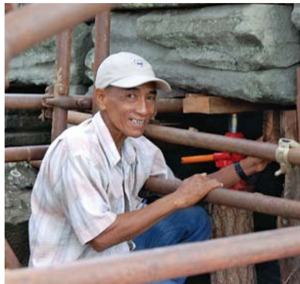
Erecting support scaffolding at Banteay Chhmar, Cambodia.