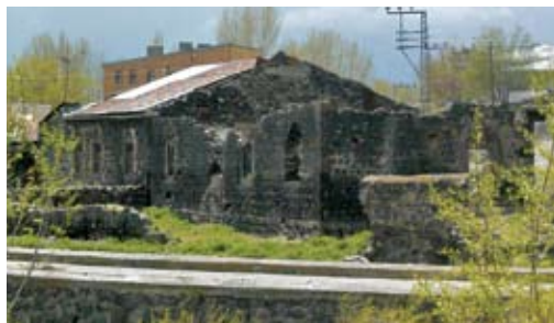
Namik Kemal Community Center before work began.