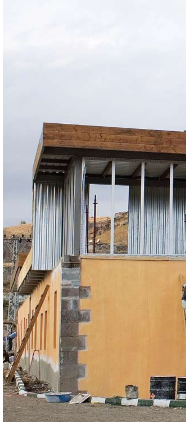
Restoration in progress on Namik Kemal Community Center, Kars, Turkey.