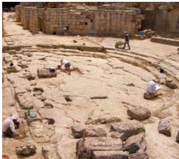
Subsurface investigations at Cyrene, Libya.