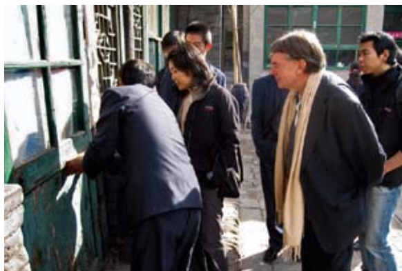
Conservation training in Pingyao, China.