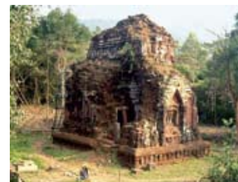
Preservation at My Son, Vietnam, in progress (left) and after stabilization (right).