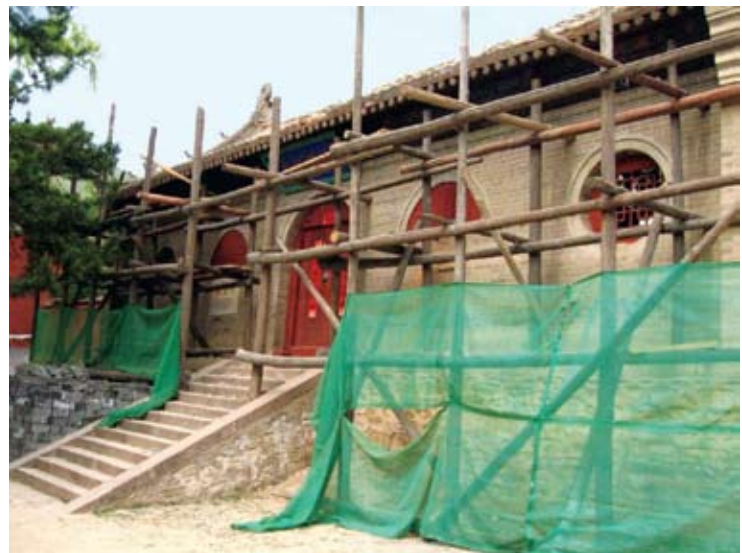
South facade of the entrance gate under restoration, Foguang, China.

Foguang, an architectural jewel of Chinese civilization, is one of the only two remaining significant wooden buildings from the Tang Dynasty.