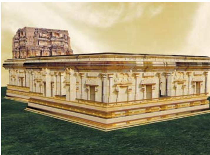
Top: Conservation training, Siem Reap, Cambodia.