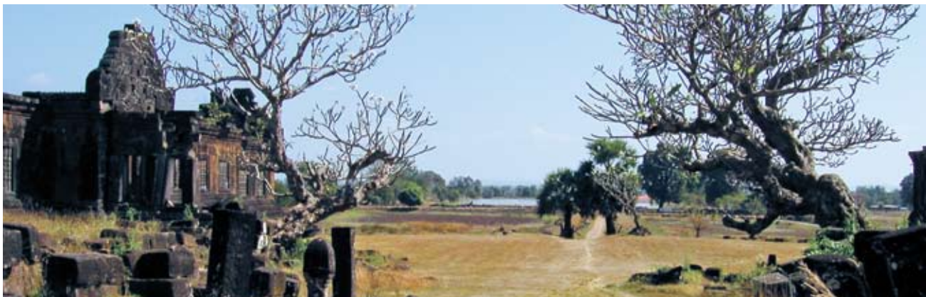
View of the Wat Phu complex, Laos.

Wat Phu is the most important monumental complex inside the Champasak Archaeological Park, nominated UNESCO World Heritage Site in 2001, and covers an area of 400 square kilometers.