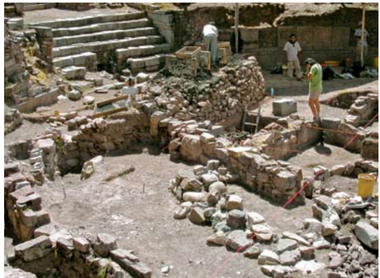
Investigation under way, Chavín de Huántar, Peru.

Located high in the Andes, Chavín de Huántar is the oldest and one of the most endangered archaeological UNESCO World Heritage Sites in Peru.