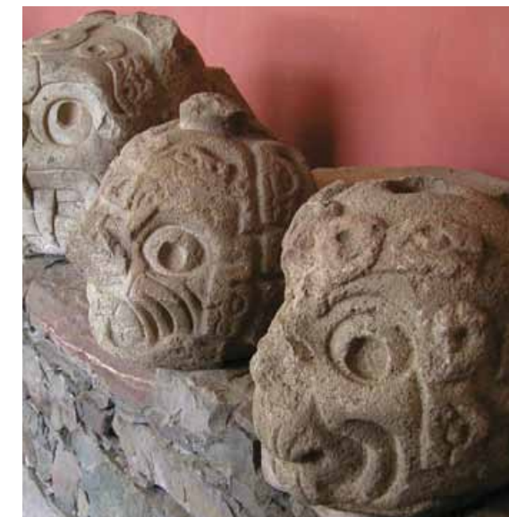
Above: Chavín de Huántar, Peru

Invited participants will share their own experiences from business, government, academia and conservation through afternoon workshop sessions and expert panels will discuss the challenges and innovative solutions in heritage conservation, master planning, site management, sustainable preservation and tourism, and integrated community development in the Americas, Asia, Eastern Europe, the Middle East and Africa.