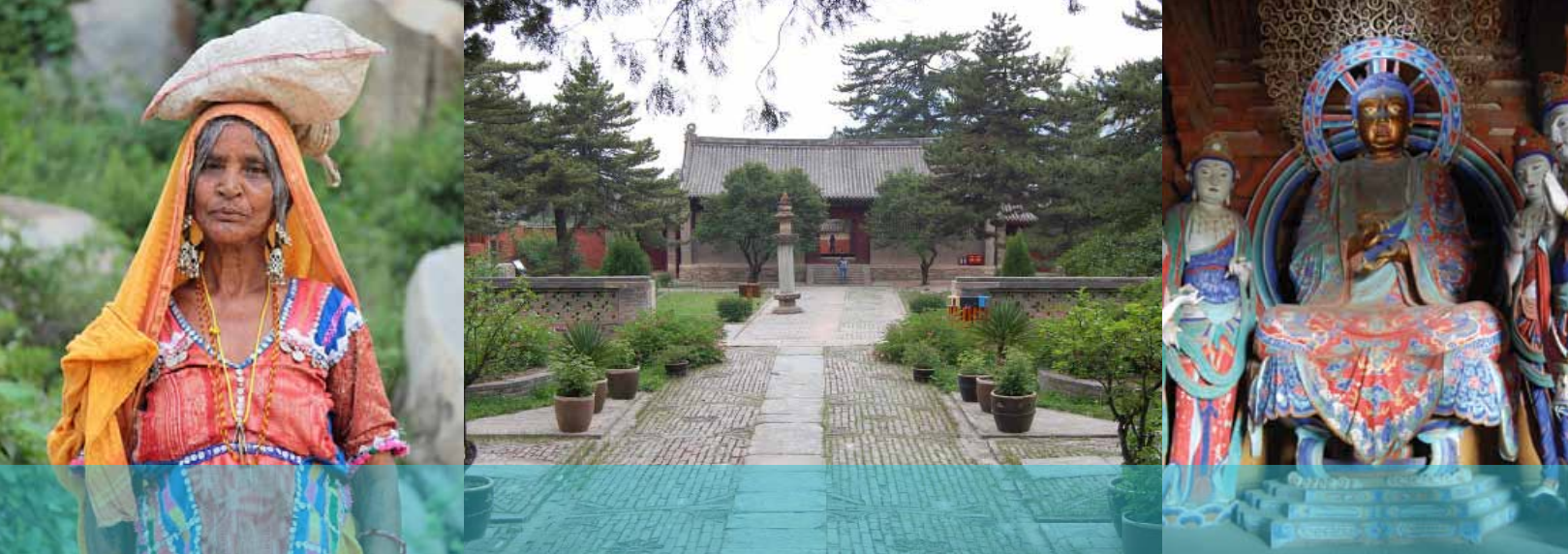
Left: Hampi, India Center and right: Foguang Temple, China

Humankind's most important archaeological and cultural heritage sites in developing countries are under threat like never before from uncontrolled development, mass tourism, looting and environmental degradation. Yet these sites generate cultural pride and billions of dollars every year for developing nations.