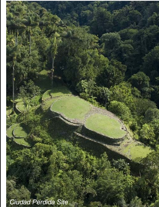
Ciudad Perdida Site